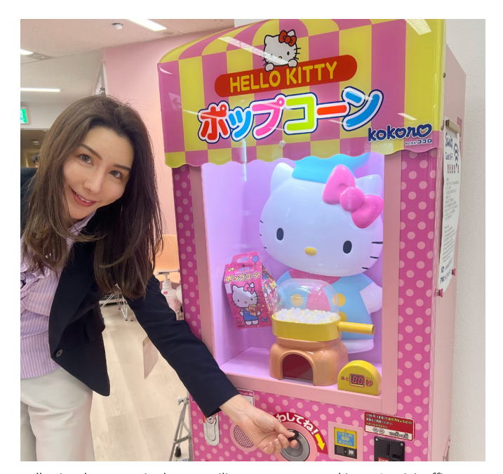
Hello\ Kitty\ demonstrating\ her\ versatility\ as\ a\ popcorn\ machine\ at\ Sanrio's\ offices.

Looking ahead, it feels as though there are plenty of reasons to be optimistic, and now is the time for investors to really play their part. TSE has set the stage for corporate Japan, but policymakers are handing the baton over to the market, recently speaking to an audience of over 90, mostly foreign, investors on this approach.