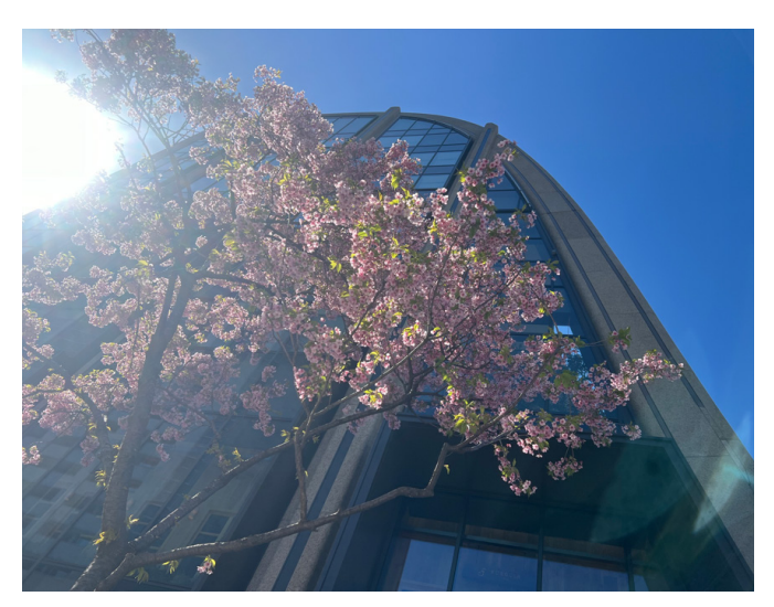
Japan in full bloom, from cherry blossom to the stock market.