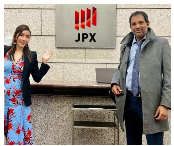
The stock exchange is passing the baton over to investors, paving the way for market-driven reform.

Our meeting with the BoJ indicated similar goals, albeit through different means, with governance reform specifically being the domain of the TSE. The central bank disclosed a long-term plan to stop purchasing ETFs, currently playing the part of one of the largest silent investors in the market, in order to make way for market driven reform.