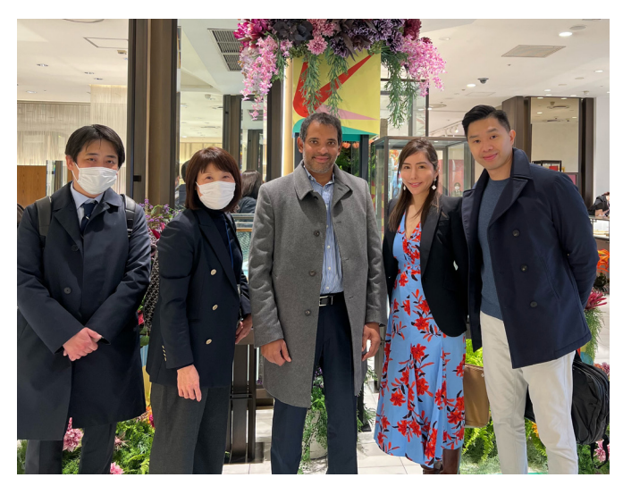
Visiting Isetan's personal shopping service, gaisho.

This resilience seems in part due to a re-focusing on high end, ultra-wealthy customers, moving away from a broader target market. Isetan, for example, has revamped its personal concierge service, gaisho, which has become a status symbol for influencers. Its top clients are spending several million a year on fashion and art, as well as on cars and condos through gaisho's recommendation service.